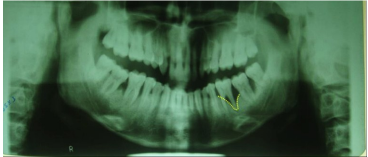
Fig. (1): OPG at baseline showing areas of localized periodontitis.

of treatment. Patient was guided for oral hygiene measures every month and a OPG was decided to be taken at 6<sup>th</sup>month recall. At same visit oral hygiene indices were repeated along with a comprehensive periodontal examination. There was significant improvement in oral hygiene score, gingival score andhalitosis grade. On comparing OPG a clinically significant bone regeneration was observed which was correlated with improvement in mobility and CAL scores( Fig. 2 ), ( Table. 1 ).